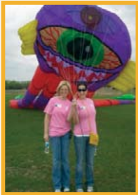
Junior League pictured with the 140 feet long Purple People Eater.

F est of Tails, the annual family and dog friendly event produced by Friends of the Parks, returns to McAllister Park on Saturday, March 20th . This event welcomes kite and dog enthusiasts from near and far. The free event features something for every member of the family. Highlights include music, arts and crafts, a pooch parade, and a sky full of multihued kites!