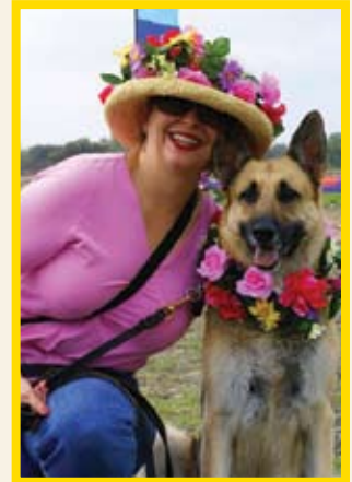
Dog Fair Contestants

For further information on Fest of Tails , please visit www.festoftails.org or call 210-212-8423. 🍀